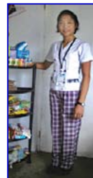
At college with her new legs