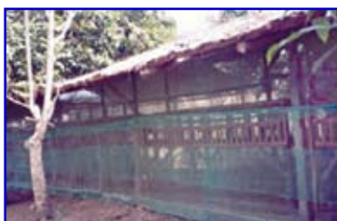
Chicken coop: creating self-reliance

We support outpatient livelihood programs for patients who are still disfigured after being cured by drug therapy. We help provide more than 50 families a home, a livelihood and schooling for the children on land provided by The Dominican Sisters. Projects have included a chicken coop, heads of pigs, a computer, shoes, eyeglasses and books.